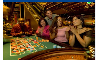
World-class gaming in Atlantic City awaits!