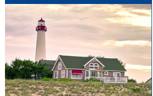
Tour the picturesque seaside town of Cape May

Departure: Biddeford Park n' Ride, I-95/Maine Turnpike, Exit #32, Route 111, Biddeford, ME @ 8 am, then Wells Station, 696 Sanford Rd, Wells, ME @ 8:30 am