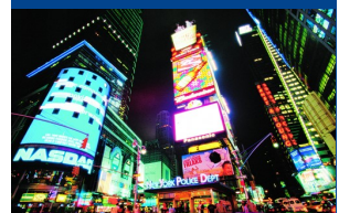
New York City - The city that never sleeps