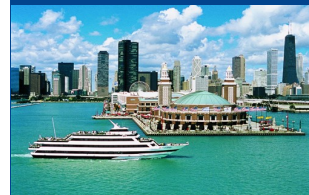
Enjoy a Skyline Cruise on Lake Michigan