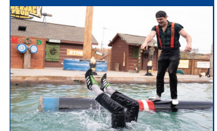
PAULA DEEN'S LUMBERJACK FEUD SHOW

Departure: Biddeford Park n' Ride, I-95/Maine Turnpike, Exit 32, Rte 111, Biddeford, ME @ 8 am, then Wells Station, 696 Sanford Rd, Wells, ME @ 8:30 am