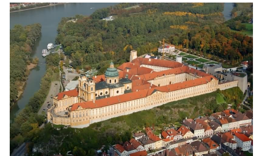
Abbey in Melk

Today your cruise ends. Board your motorcoach to the airport for your flight back home. (B)