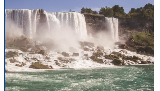
Experience a Majestic View of the Falls