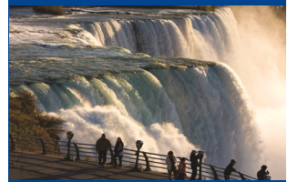
World's most famous Falls