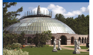
Beautiful Basilica of the National Shrine of Our Lady of Fatima