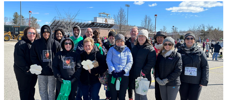
Celebrating community, connection, and shared moments on the road with Golden Rewards, stepping up for Mary's Walk, and with the Partners Bank family making memories.