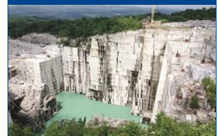
Rock of Ages Granite Quarry