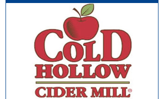
Cold Hollow Cider Mill