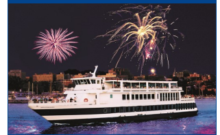
Dinner Cruise on beautiful Lake Champlain