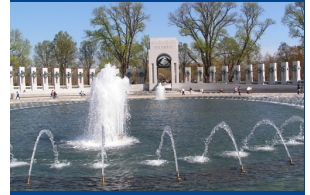
World War II Memorial